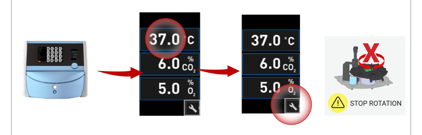
STEP 2 Place LEO 2.0's temperature probe (T1-MODULE) inside a culture dish well , so that the tip of the sensor touches the bottom of the dish.